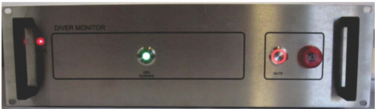
EDMS101 Dive Monitor 19"rack Unit

Power Source: 100-240Vac 50/60Hz Dimensions: 425x465x261mm (Standard 19" 6U Cabinet) Dimensions (remote HMI): 425x425x128mm (Standard 19" 3U Cabinet) 12.1" Industrial PC 317x243x66mm